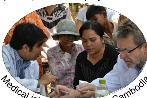
Medical intervention in rural Cambodia

Up to $5,000 USD for projects in resource poor regions lasting no more than 12 months