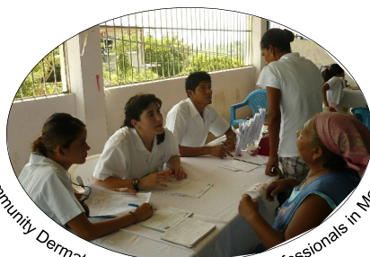
Community Dermatology training for health professionals in Mexico

Please provide detail about the methods that will be used for this project, whether it be research or medical intervention, an educational programme or workshop or another project. You may wish to discuss your project prior to submission using the above contact details.